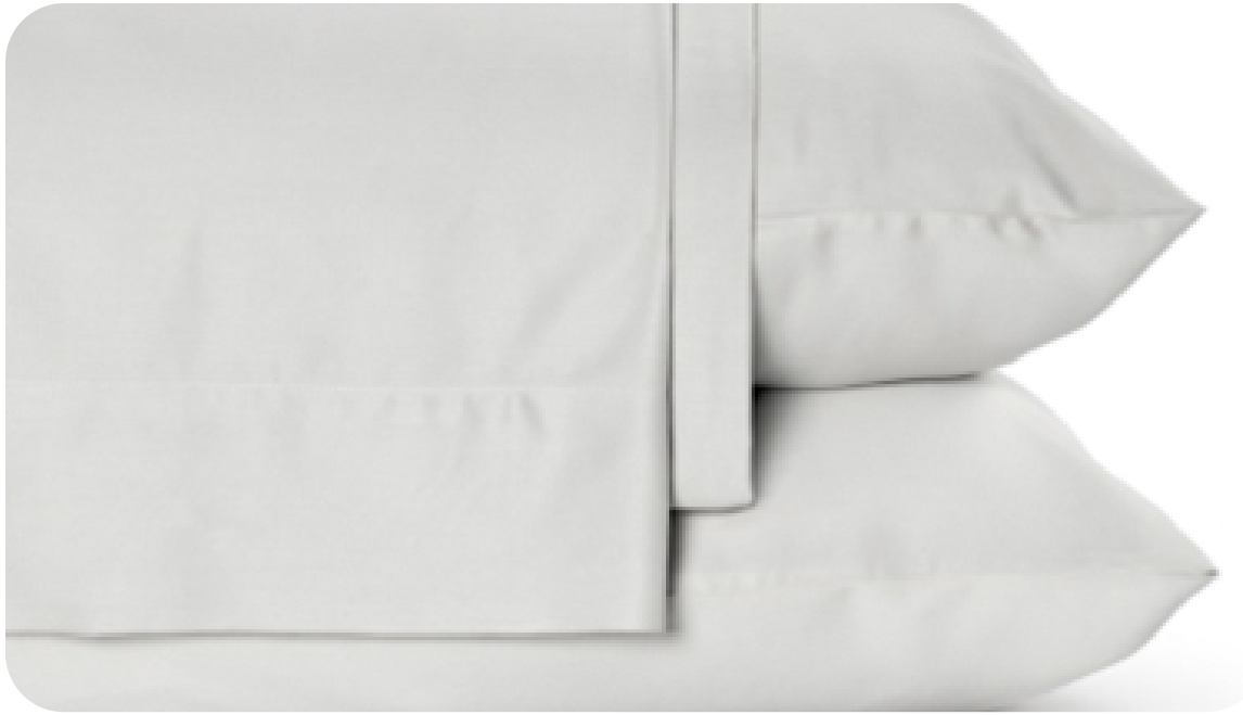
$148 ORGANIC BAMBOO SHEETS & ORGANIC COTTON TOWELS