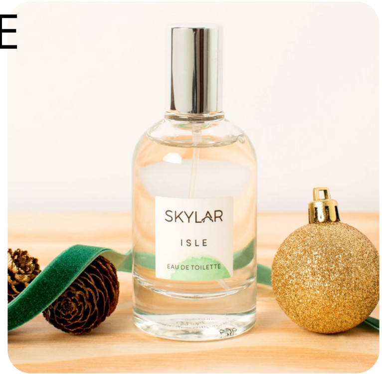
$120 SKYLAR CLEAN FRAGRANCES