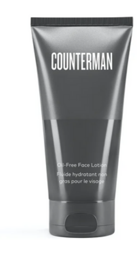
Counterman Oil-Free Face Lotion- $32