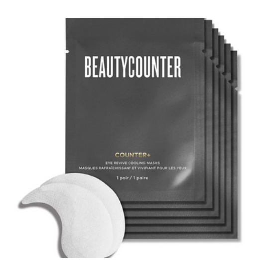
Counter+ Eye Revive Cooling Masks $49