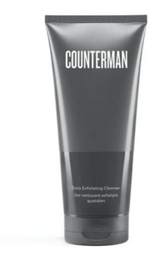
Counterman Daily Exfoliating Cleanser $25