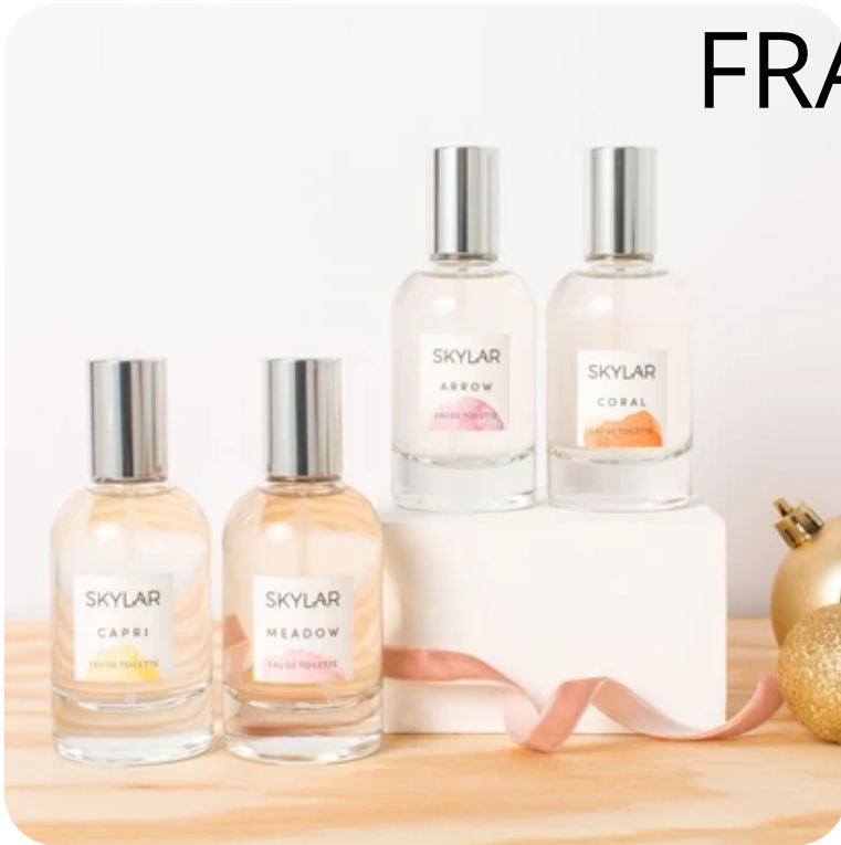
$120 SKYLAR CLEAN FRAGRANCES