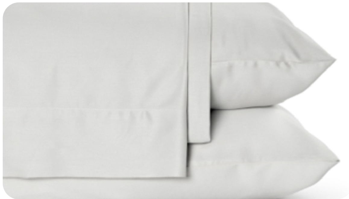
$148 ORGANIC BAMBOO SHEETS & ORGANIC COTTON TOWELS